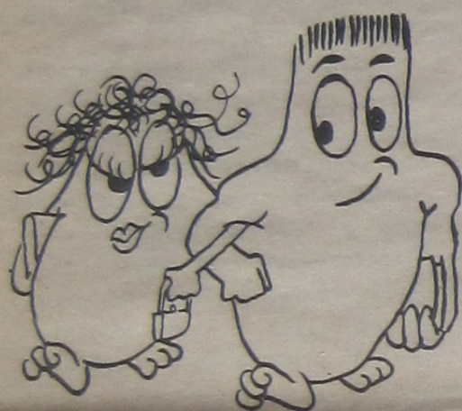
A Tribute to Couples by Gloria Schmae

Couples, you see them walking down the hallways holding hands, kissing each other goodbye before they rush to separate classes, and eating lunch together as they gaze into each other's eyes.