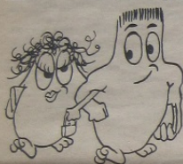
A Tribute to Couples by Gloria Schmae

Couples, you see them walking down the hallways holding hands, kissing each other goodbye before they rush to separate classes, and eating lunch together as they gaze into each other's eyes.