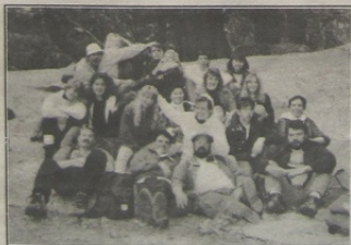
The Wilderness Adventure Club returns after a journey through Yosemite

This was only one of the many highlights the Wilderness Club members experienced between February 16 and 20, when they took part in the 11th annual Yosemite field trip. This trip was a phenomenal success, fea-