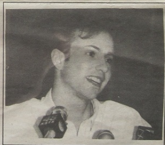
U.S. Gold Medalist Brian Boitano

What is motivating Brian for the World Championships coming up in Hungary? "I think just because it's an important competition to me, being that it might